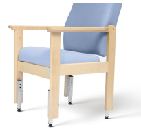
Shown with optional seat height adjusters

Perry is a stylish, durable and comfortable upholstered high back patient chair for day long postural support.